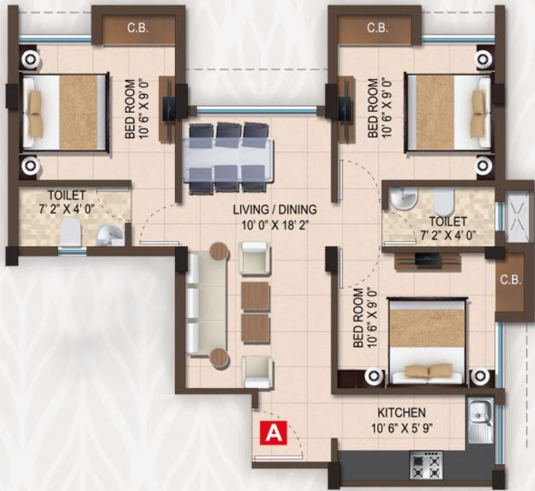
FLAT - A (3 BHK - 967 sft.)